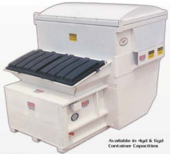
Available in 4yd & 6yd Container Capacities

This compact self-contained unit offers the same liquid tight containment as a standard size compactor but in a more compact size for space limitations. Designed to offer the same benefits of a larger unit with it's optional chute fed or hopper fed system.